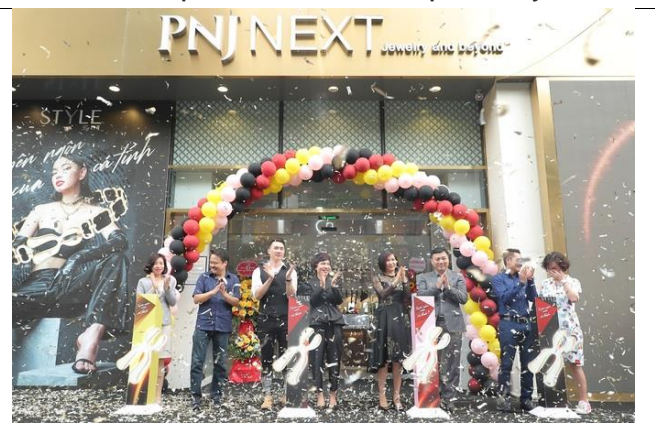
Figure 3: New PNJ Style store in PNJ Next, Ha Noi, launched in 16<sup>th</sup> Apr 21, showing the move of PNJ toward young generation and customer-oriented products based on their personality to create their lifestyle

Source: VNDIRECT Research, Company reports